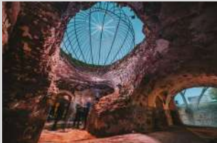
Fort no. 1