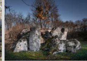
Fort no. 3