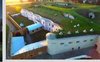
Fort no. 9