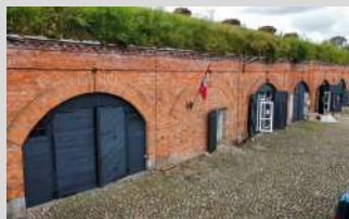
Kaunas Fortress Park workshop building