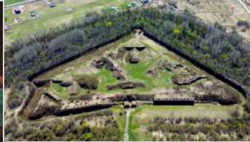
Fort no. 4